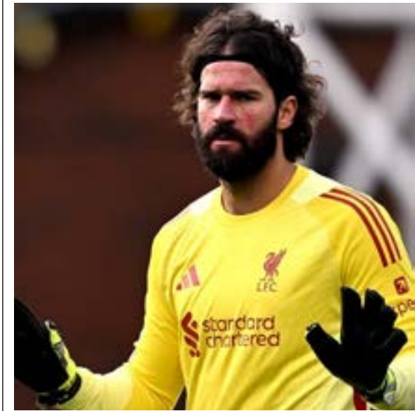
Liverpool chuan Brazil goalkeeper Alisson Becker chu season dang atan chelh an duh. Alisson hian Anfield chhuahsanin Juventus zawm a tum a, a hma lam hun tur a chiang lo rih hle.

Oscar Mingueza chuan nipui bazar inhawn hunah Premier League pan a duh. Celta Vigo leh Spain defender hi free transfer in a lak theih dawn a, ngaihv zingah.