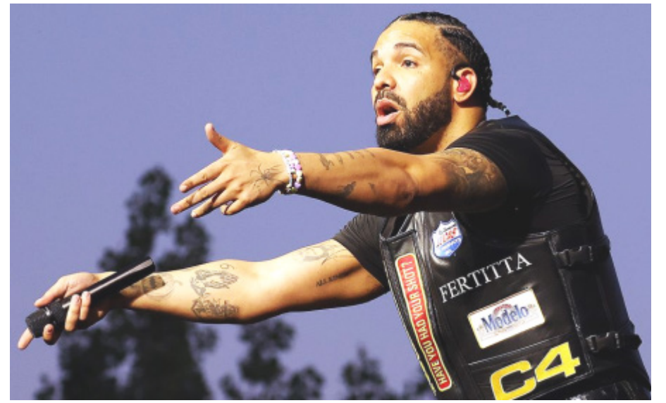
Chart No.1 hlui Ella Langley "Chooosin Texas" chu No.5 atangin No.2 a kai thar leh ta a,

a hla dang, chart No.2 pawh lo ni tawh "Be Her" chu No.14 atangin No.3-ah a invawrh thar leh ta bawh.