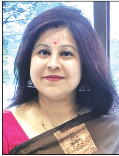
By Bristi Borgohain

Memory is the invisible thread that weaves our identity, connecting our yesterday with our today. When that thread begins to fray, the world does not merely lose its clarity; an individual loses their anchor. Dementia is often misunderstood as the inevitable, harmless forgetfulness of old age. In reality, it is a progressive neurological crisis that quietly dismantles an individual's memory, language, BEHAVIOUR, and capacity to navigate daily life.